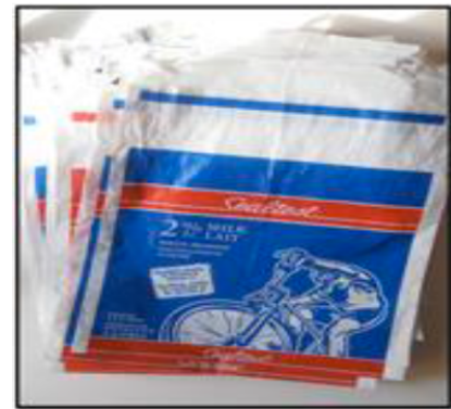
The plastic outer shell of a milk bag.

Other key points: they are UV ray resistant and have a life span of 25 years! Health-care professionals also can use these milk-bag mats as a substitute for an operating bed/table when resources are scarce.