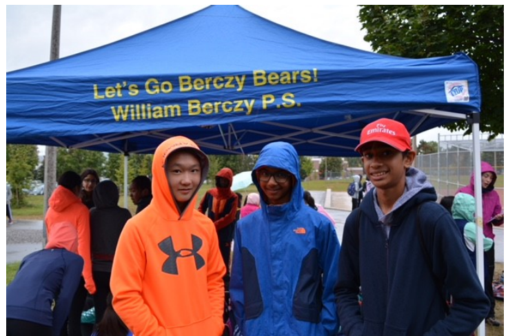
Our Cross Country Runners Braving the Cold Rain