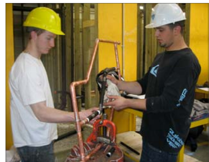
Dual Credit Accelerated OYAP Plumber