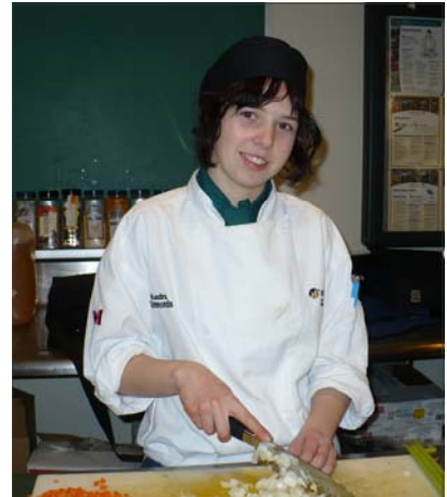
Dual Credit Accelerated OYAP Cook

Parents/guardians and students are encouraged to attend the program Open House events in October/November. Interested students should consult their Community-Based Education, Guidance, or Personalized Alternative Education teacher.