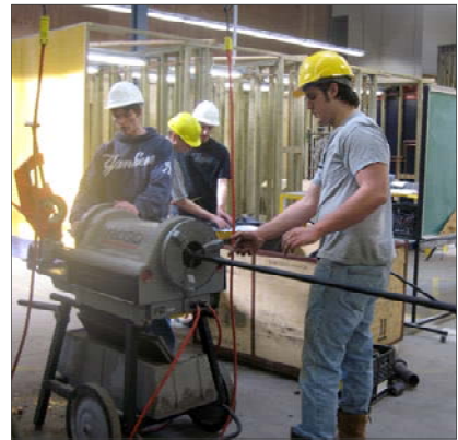
Dual Credit Accelerated OYAP Electrician