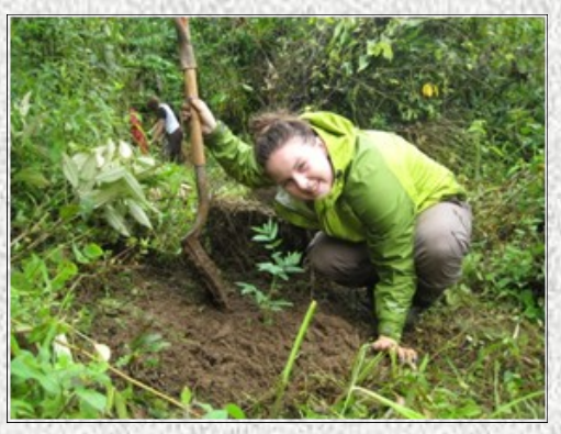
Planting trees in the rainforest

Visit Website: <u>www.yrdsb.edu.on.ca/ice</u> Costa Rica Summer International Co-op