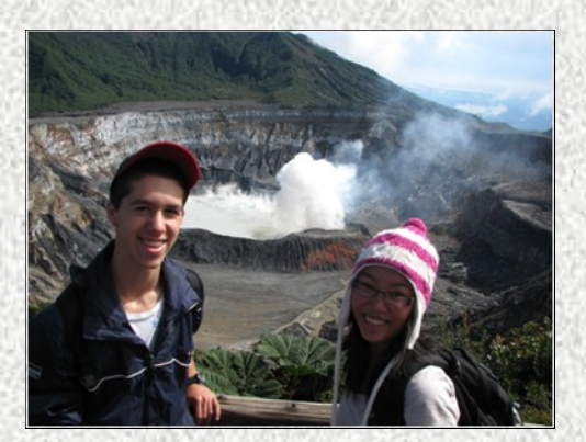
Admiring Poas Volcano

We headed out as young students looking to earn credits and maybe make a difference, and we came back Global Citizens!