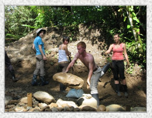
Building a retaining wall at a Biological Reserve