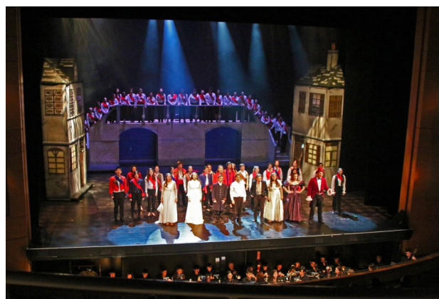
Set from AMHS's production of Les Miserables

Alexander Mackenzie High School 300 Major Mackenzie Drive West Richmond Hill, Ontario L4C 3S3