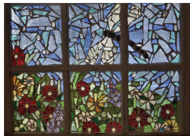
Julia Peacock's Stained Glass window