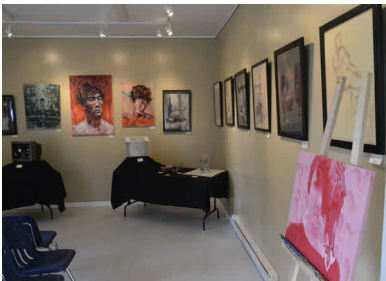
Momentum Art Show at Boynton House

We would also like to thank all the parents and guardians of our students for being so supportive. Have a great summer!