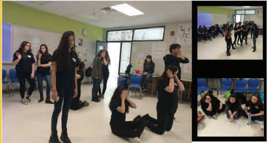
Theatre ARTS students know how to perform! Above: Theatre ARTS 9 at Together We Are Better Conference, Left: A Midsummer Night's Dream , Right: That Elusive Spark