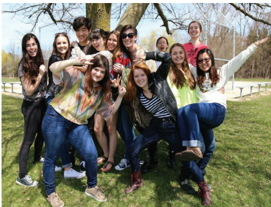
The graduating Arts Mack Visual Arts class