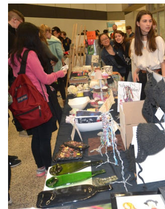
AMAC Fights Back Craft Sale