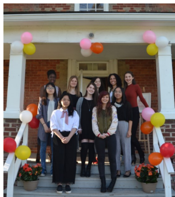
Arts Mack grads at Boynton House