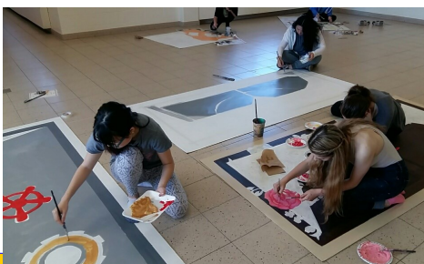
Senior students at work on their legacy pieces