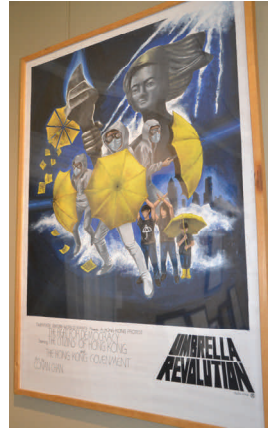
Umbrella Revolution by Conan Chan