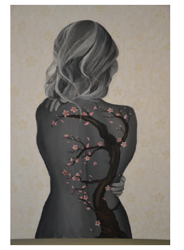
blabitty bla by Taia