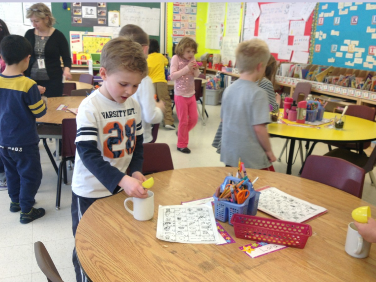
Students filled eggs with a variety of dried fruits for a nutritious and healthy treat.