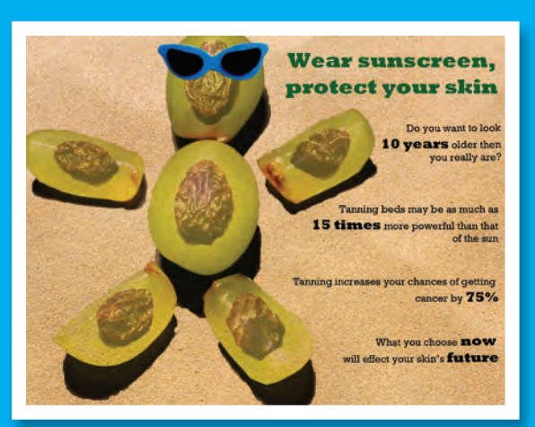
CREATED BY AMY SUTTON & COURTNEY BACKUS