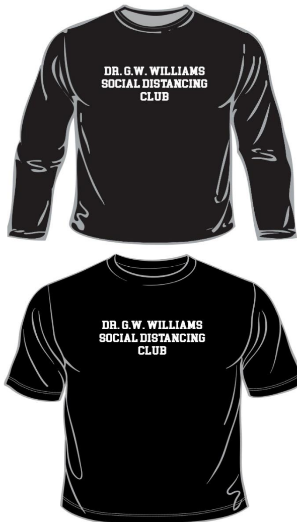
Photo of the shirt attached.

Description: With no in-person clubs, teams or functions this year what better than a club we can all belong to?! The GW Williams Social Distancing Club shirts are ready to be ordered! Sizes range from small to XXX-Large and come in a huge variety of colours. Orders can be placed until October 20th order your today!