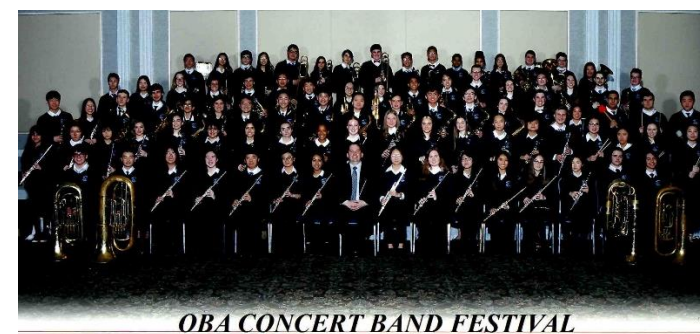
OBA CONCERT BAND FESTIVAL MARKHAM ONTARIO 2020

Grade 9 Concert Band: 2 Gold Awards, Overall Outstanding Performance Award, Invitation to MusicFest Nationals Senior Wind Ensemble: 1 Gold Award, 1 Silver Award, Brass Excellence Award, Invitation to MusicFest Nationals