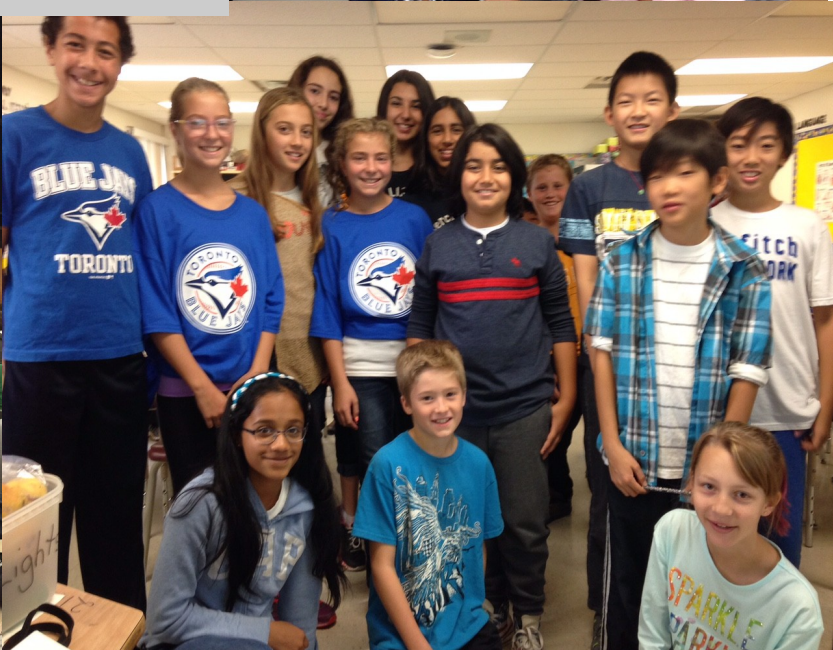
Our Winners of the Responsibility Award