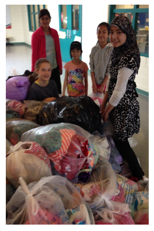
Members of the EcoTeam with the many, many bags of clothing that were donated