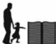
Family Literacy Day