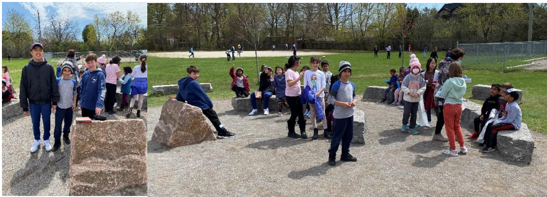
Eco-Gators leading our school yard clean up in support of Earth Day

Since the beginning of the school year, students have been involved in many extra-curricular activities run voluntarily by our amazing Gibson staff during recesses and lunch. Students have also had the opportunity to participate in other activities such as Intermediate Band, Yearbook Photographers and Spirit Council; and recently our EcoGators and Lunch Monitors have been planning Litterless Lunches, Earth Day school yard clean up and educating students on the proper use of the trash, recycling and composting bins.