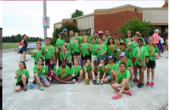
CONGRATULATIONS GIRLS CAN RUN