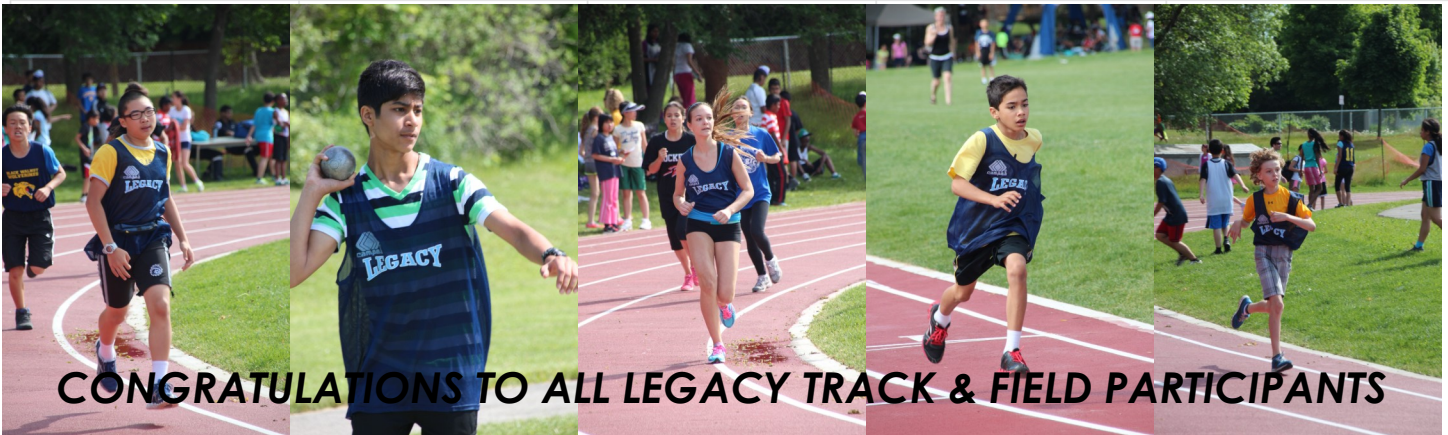
CONGRATULATIONS TO ALL LEGACY TRACK & FIELD PARTICIPANTS