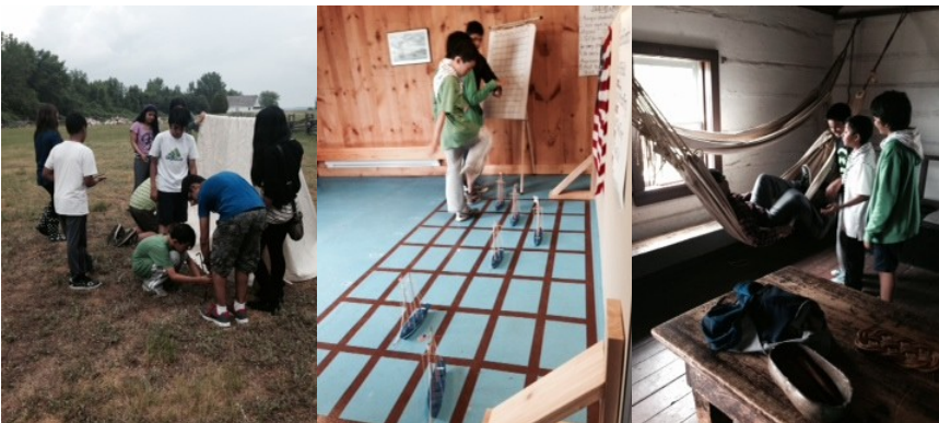
GRADE 7 FIELD TRIP TO DISCOVERY HARBOUR, PENETENQUISHENE, ONTARIO