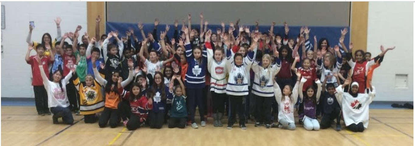
Legacy Spirit Day Jersey Day