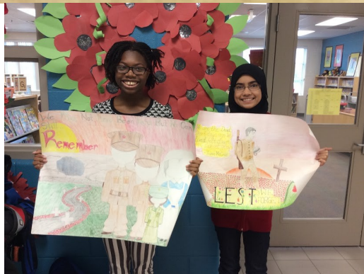
Special Posters for Remembrance Veterans Poster Contest