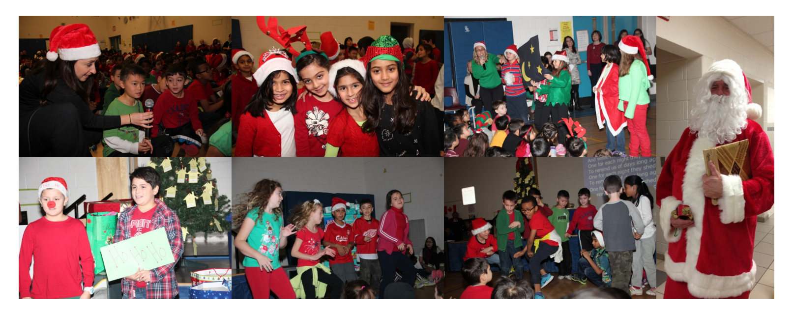
Happy Holidays & Happy New Year