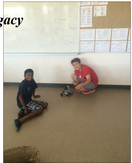
Coding & Robotics at Legacy