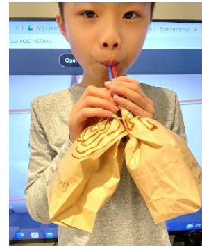
Figure 6: RWPS student's submission to the Google Classroom - and comment.