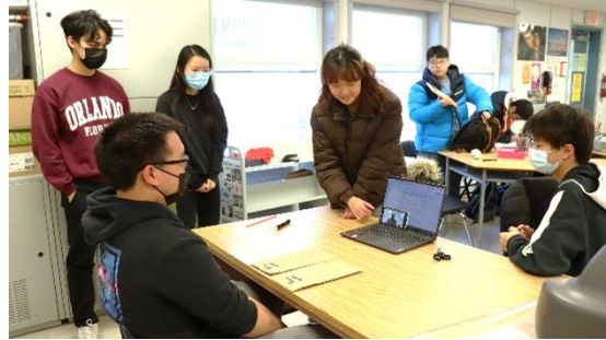
Figure 4: Recording the Human Body Systems unit after school on a Wednesday.

When RWPS students finish their activities, the handouts are sent back to KAST @ MSS in their folders to be marked by KAST members during the next club meeting. Not only are KAST members eager to see what RWPS has learned, but it also gives them an opportunity to receive and write a message to their assigned students. Points are awarded to RWPS students based on completion, correct answers, and Google Classroom posts of their creations and work. Take a look at the response from RWPS!