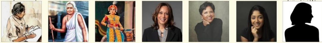
WOMEN OF EELAM

Tamil Women Excellence Yesterday, Today & Tomorrow