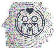
MSS Mental Health Resource

This is a mental health resource that will appear in the E-Bulletin weekly that was created by past and present Markville students.