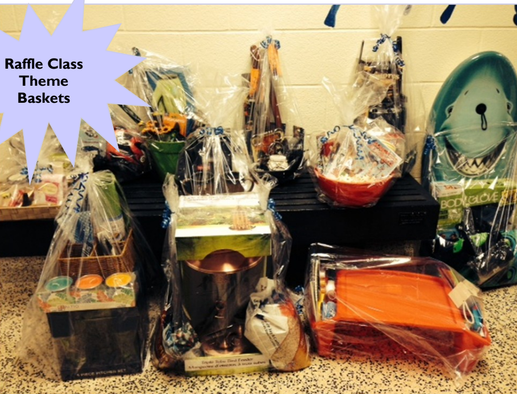
Raffle Class Theme Baskets

We also need parent volunteers to help us run the BBQ. If you can volunteer for 30 minutes, please contact Sandra McClelland at mcclerlands@rogers.com .