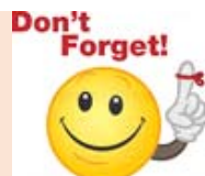
Photo Day Reminder!

Student individual and classroom photos will be held on Monday, October 23!