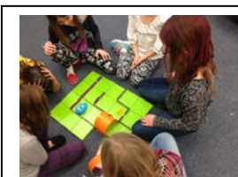
Grade 3 students engaged in coding activities (pictured above and below).