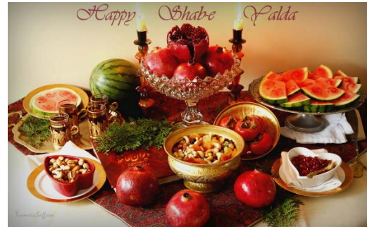
Happy Winter solstice / HappyYalda Night!