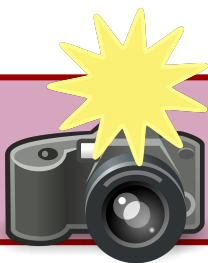
Photo Day September 14th