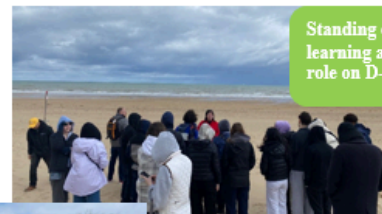
Standing on Juno Beach learning about Canada's role on D-Day!