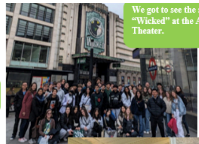
We got to see the show "Wicked" at the Apollo Theater.