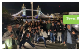
Tower Bridge lit up at night!