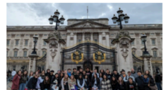
Visiting Buckingham Palace

Students explored various areas on this trip including the Winston Churchill War Rooms, Buckingham Palace, Tower Bridge & the Tower of London, British Museum, Caen Center, Juno Beach, Keukenhof Gardens, Anne Frank's House, and a biking tour of Amsterdam!