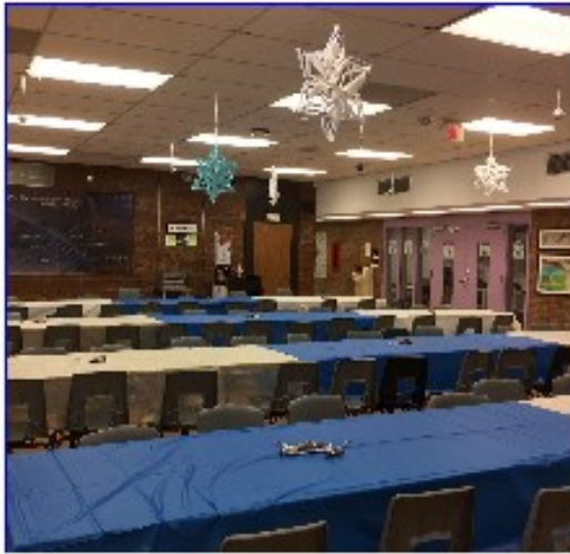
Winter Wonderland Decorations (Set-Up) (Pre-Lunch Rush!)