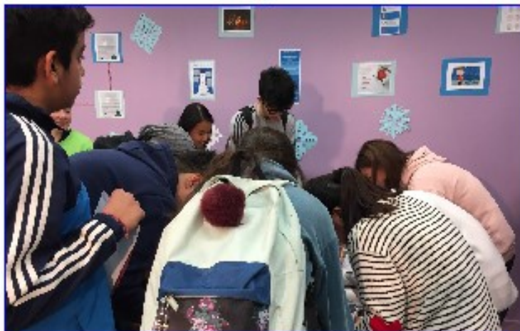
One Craft Station during the Rush!