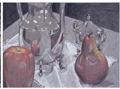
Artworks from the AP College Board website.