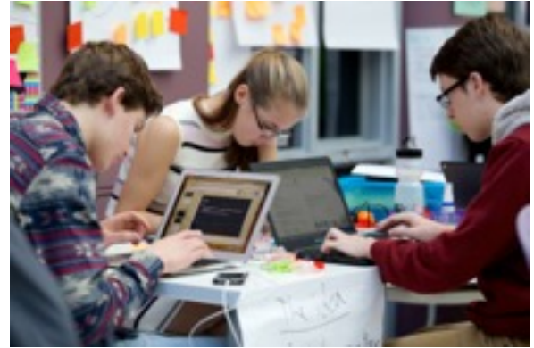
Moving Student Ideas Forward Through Design Thinking Processes

Youth Innovation By Design focuses on ways in which innovators identify problems, see them as opportunities, generate ideas, and organize resources to develop and take successful solutions forward into the world, both for-profit and not-for-profit. Students will be encouraged to use a variety of design thinking techniques, including the Innovation, Creativity, and Entrepreneurship (ICE) Toolkit to develop and grow their ideas. They will consider the ethical and legal implications of decisions, the breadth of roles in innovation culture as well as sustainability models. In support of both group and individualized projects, students will be introduced to, and taught how to connect with, local and global ecosystems. Student learning throughout the course will be supported by guest speakers and mentors provided through a collaboration with York University's Markham Innovation Centre (YU-MIC) and Innovation York.