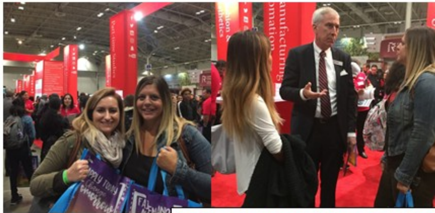
Staff chatting with president of Seneca College

November 20th - Queen's Chancellor Scholarship (Practice application currently available online). Please see step by step instructions on Moodle. Submit to Guidance by the end of day on November 20th for school sponsorship consideration.