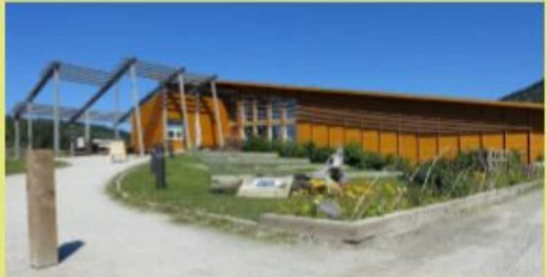
Dänojà Zho Cultural Centre , Dawson City, Yukon

Yukon First Nations set the land-claims process in motion during the 1970s. Tr'ondëk Hwëch'in began negotiating their individual land claim in 1991. The Tr'ondëk Hwëch'in Final Agreement was signed on July 16, 1998, and came into effect on September 15, 1998.