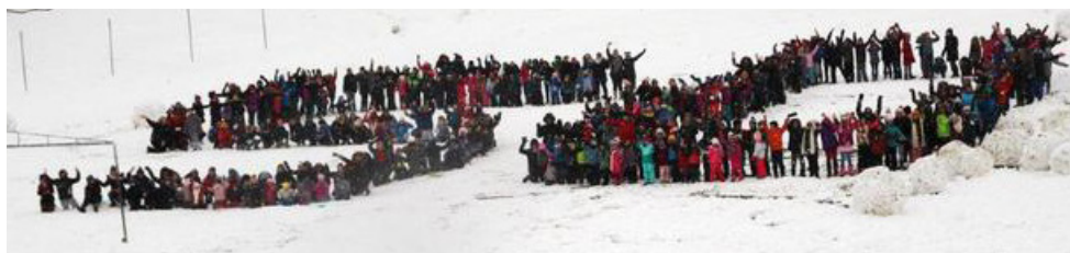
Wellington's 50th anniversary takes shape: Wellington students gather in the back field for our own 50-year tribute