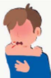
NEW OR WORSENING COUGH