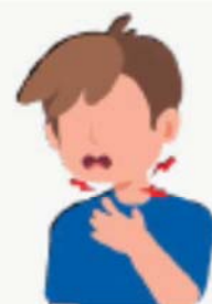
SORE THROAT OR DIFFICULTY SWALLOWING