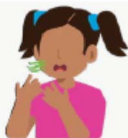
ALTERED SMELL OR TASTE