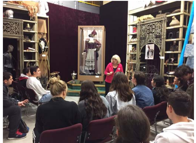
Learning about costume design