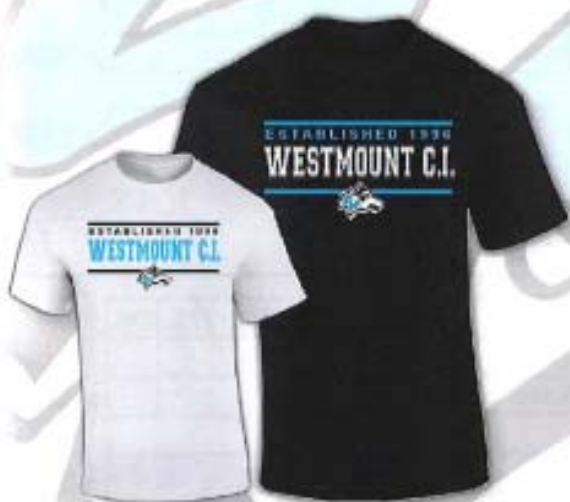
Short Sleeve T-Shirts