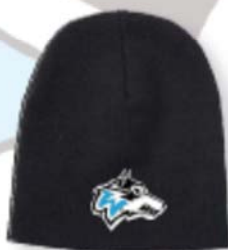
Black Knit Skull Cap