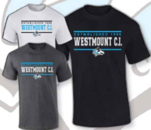
Short Sleeve T-Shirts