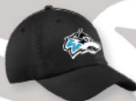
Black Fitted Mid Profile Cap