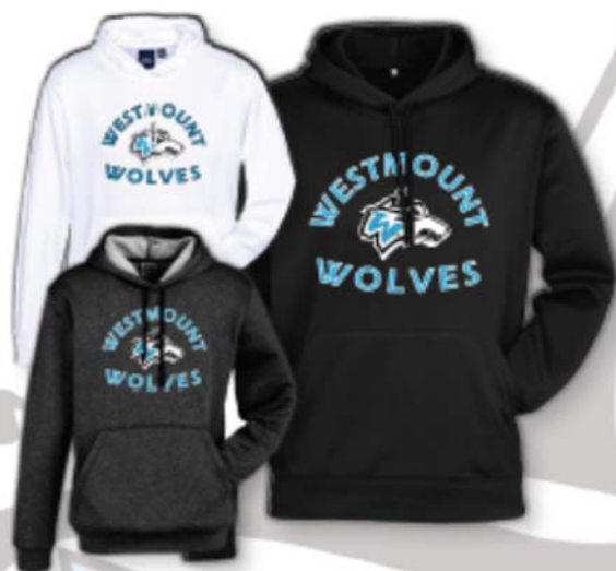
Hype Pull-On Hoodie