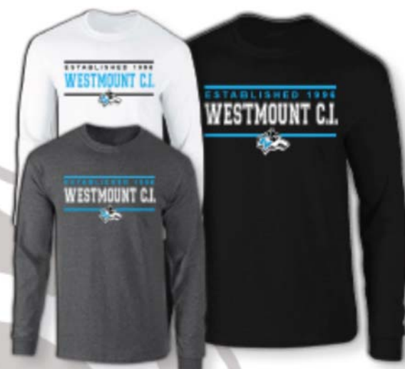
Long Sleeve Shirt