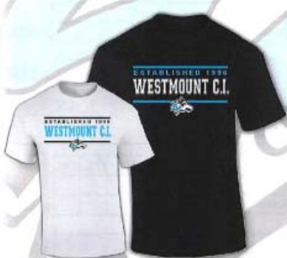
Short Sleeve T-Shirts