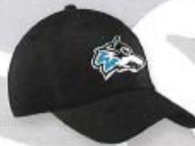
Black Fitted Mid Profile Cap