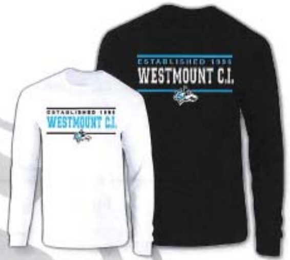
Long Sleeve Shirt