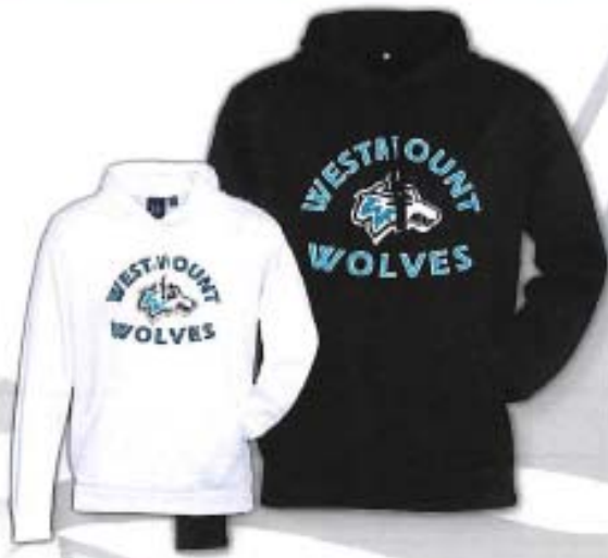
Hype Pull-On Hoodie