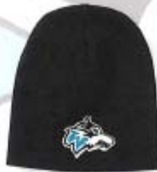
Black Knit Skull Cap