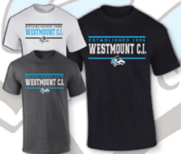
Short Sleeve T-Shirts