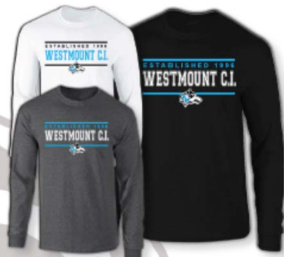
Long Sleeve Shirt