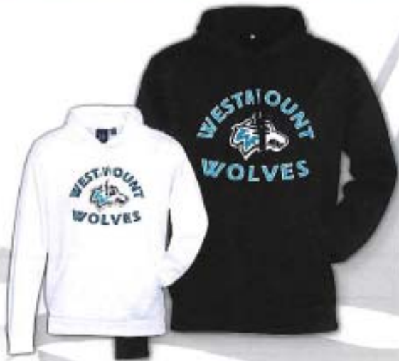
Hype Pull-On Hoodie