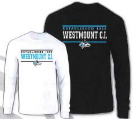
Long Sleeve Shirt