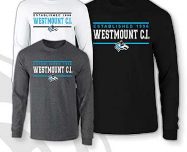
Long Sleeve Shirt