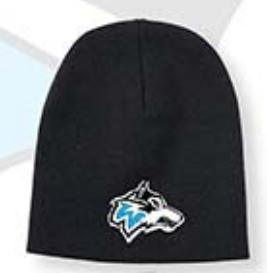
Black Knit Skull Cap