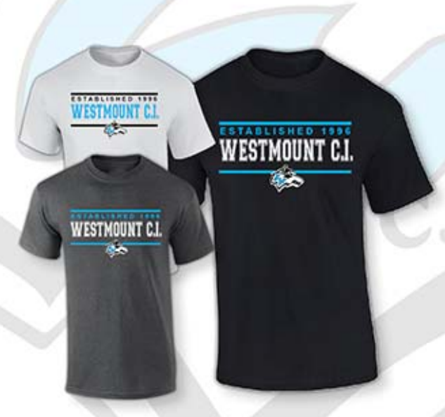
Short Sleeve T-Shirts