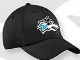
Black Fitted Mid Profile Cap