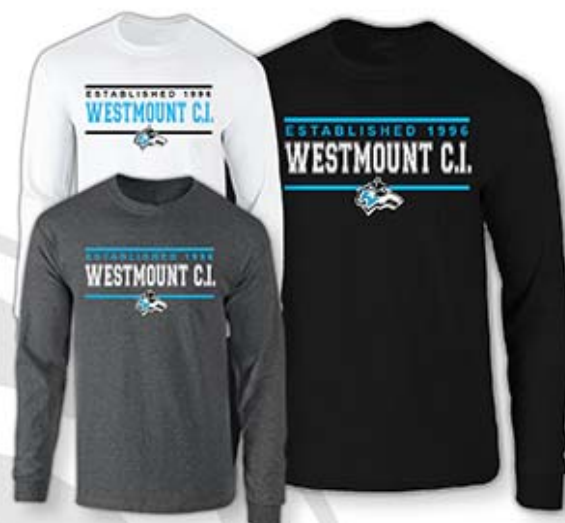
Long Sleeve Shirt