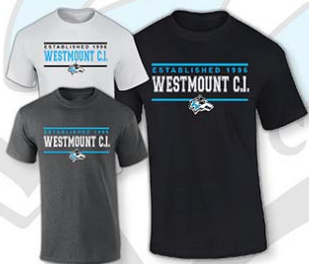
Short Sleeve T-Shirts