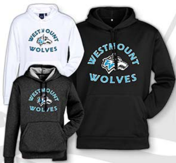
Hype Pull-On Hoodie