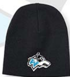
Black Knit Skull Cap