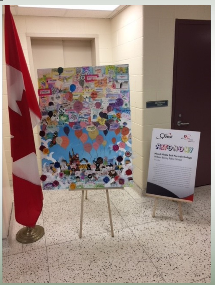
The Finished Collage, on display in our school

Last month, a few eighth graders, including myself, were given the opportunity to collaboratively create and display a collage at the YRDSB Quest Conference for Mental Health and Well-Being. Each pair of Berczy students created their own individualized stations to get the participants involved in the making of our collage, and I can say that we are very proud of the result. The part belonging to my partner and I were the clouds cut out of paper, and we had the audience write their dreams and aspirations on them. I asked one of the participants about the experience. "It was a very unique experience, and it's nice to work on a big project with everybody," they said. Being given such an opportunity to go to the conference and give people a chance to create Art was truly an unforgettable experience, and I hope to have more opportunities to display our artwork in the future.