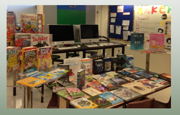
Hot chocolate and a metre-long bill = many awesome new books for our Learning Commons!