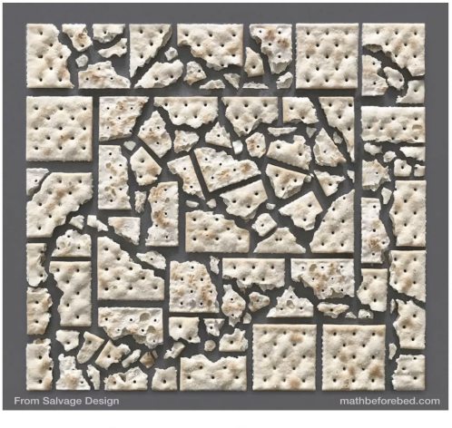
What do you notice? What do you wonder?

On <u>Math Before Bed</u> there are a variety of images that promote mathematical thinking. Show your child an image and ask them "what do you notice? what are you wondering about?". This promotes mathematical thinking - and then you can have them investigate one of their wonderings and come up with a solution. What a great time to ask them the questions above to really uncover what they are thinking!!