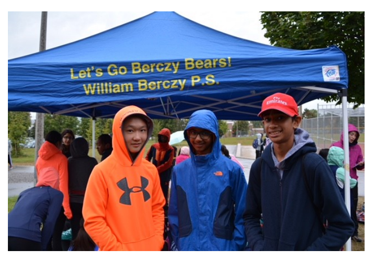
Our Cross Country Runners Braving the Cold Rain